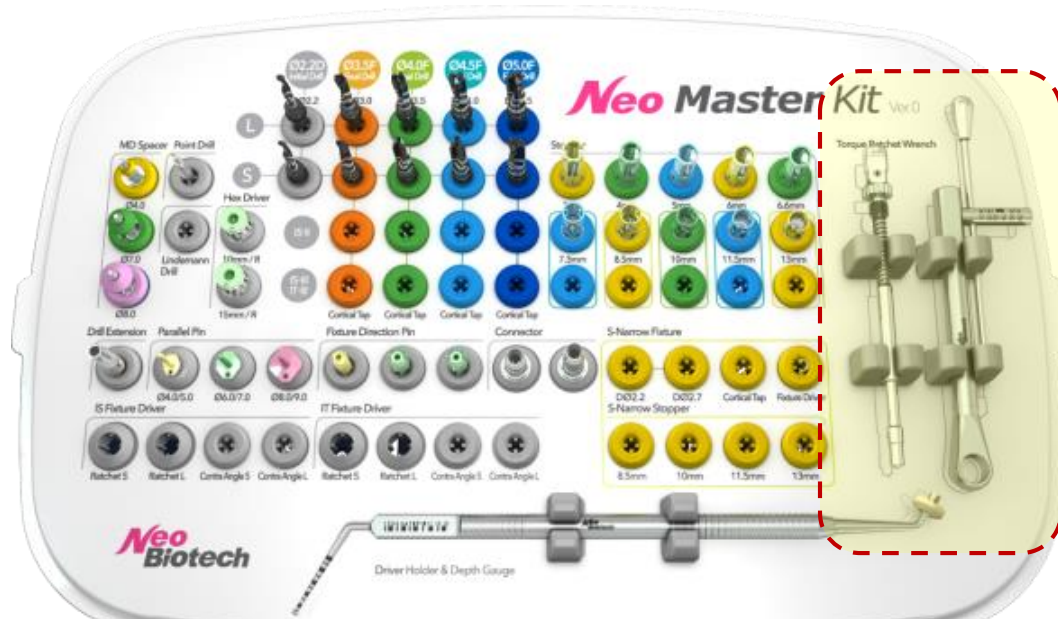
1) Neo Master Kit _ Middle tray